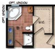
OPT. GLAMOUR BATH